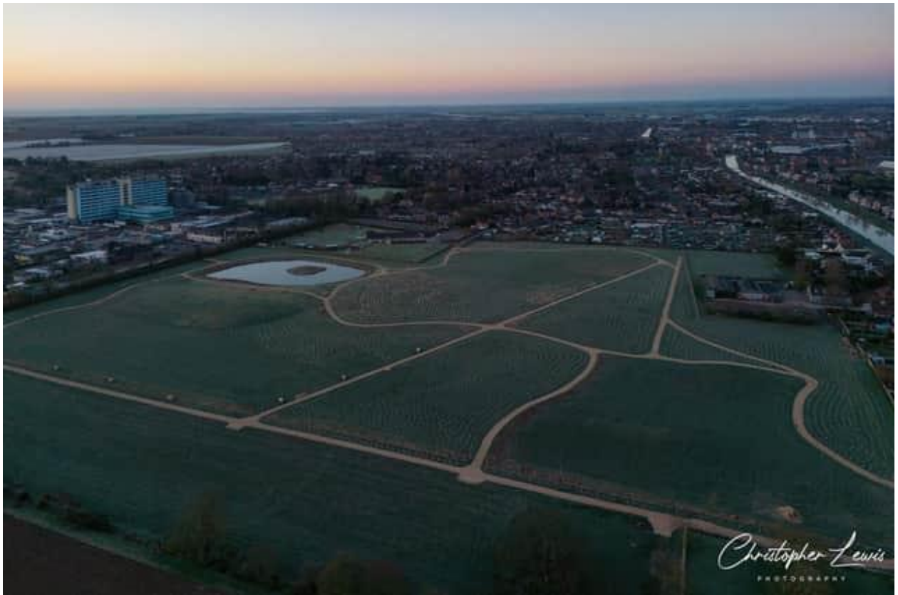
Christopher Lewis Photography's aerial photo of Dion's Wood, situated near to Boston's Pilgrim Hospital.

They also aim to “prioritise the wildlife”, so no dogs will be allowed and visitors will be asked to keep to the paths.